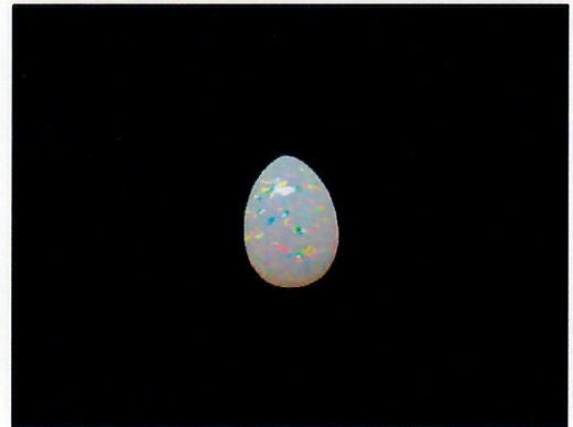
Dieses Bild dient nur der Identifikation und stellt nicht die Originalgröße bzw. die tatsächliche Farbe dar.